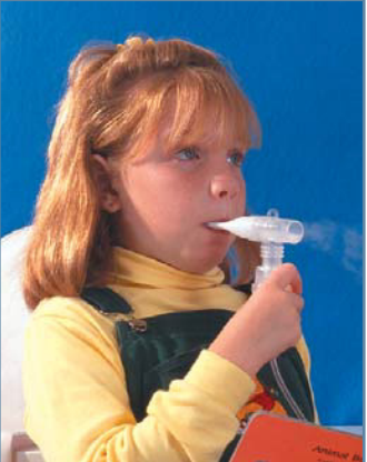
Children with respiratory diseases should be monitored closely during smoke alerts.

indoors, take steps to keep indoor air as clean as possible. Keep your windows and doors closed – unless it's extremely hot outside. Run your air conditioner, if you have one. Keep the fresh air intake closed and the filter clean to prevent bringing additional smoke inside. Note: If you don't have an air conditioner, staying inside with the windows closed may be dangerous in extremely hot weather. In these cases, seek alter-native shelter.