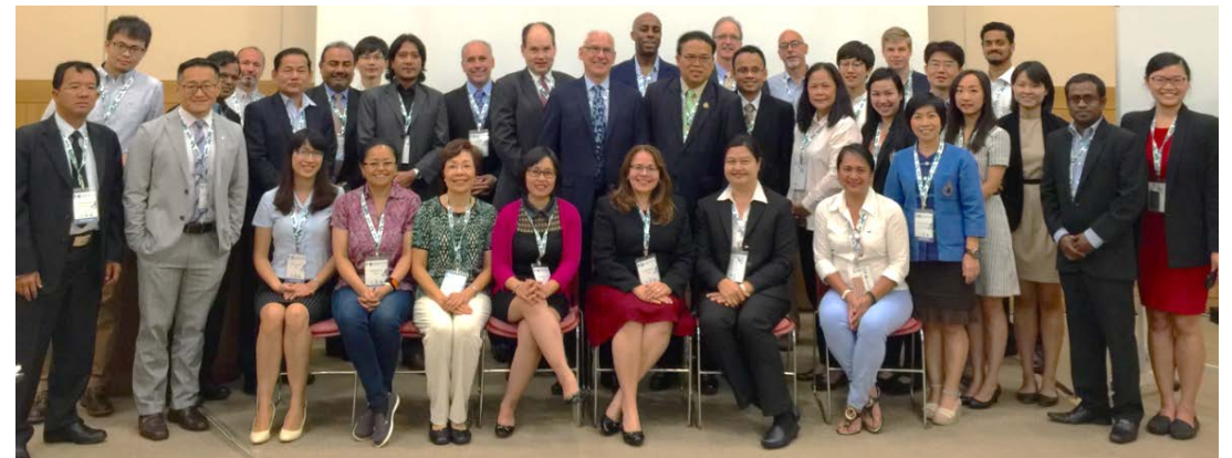
AirNow International Meeting at the 2016 Better Air Quality Conference Busan, South Korea